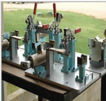
FRP Jig Fixtures