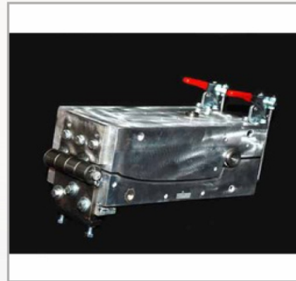
Metal Tooling Dies