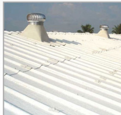
Heat Insulation Services